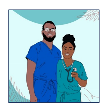
Black Mind & Body

A sampling of SheKnows' signature series