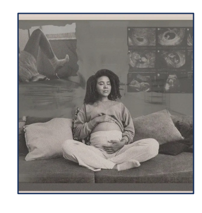
Black Maternal Health Crisis SEE THE SERIES >