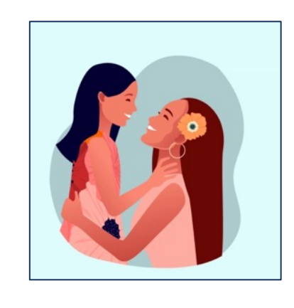
Mamá y Más